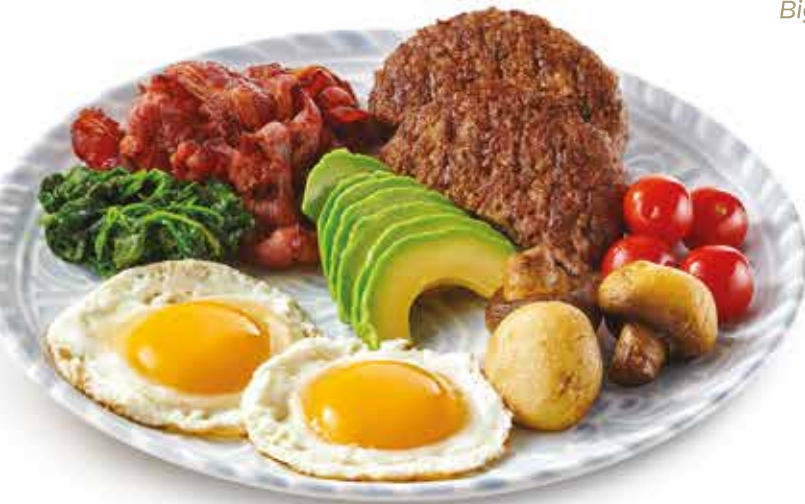
Big Keto Breakfast