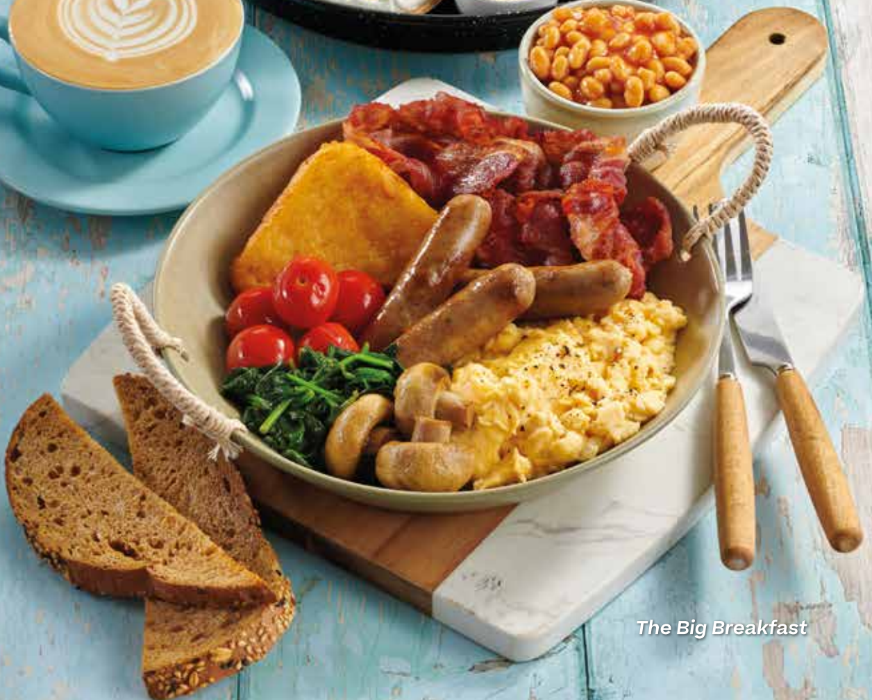
The Big Breakfast