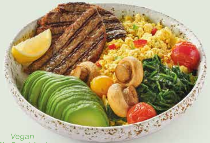
Vegan Big Breakfast

maple & coconut milk infused chia seeds, blueberries, strawberries, raspberries, coconut chips