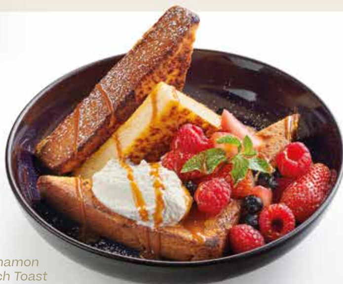
Cinnamon French Toast

pancakes, nutella, mixed fresh berries, crushed pistachio, chocolate sauce