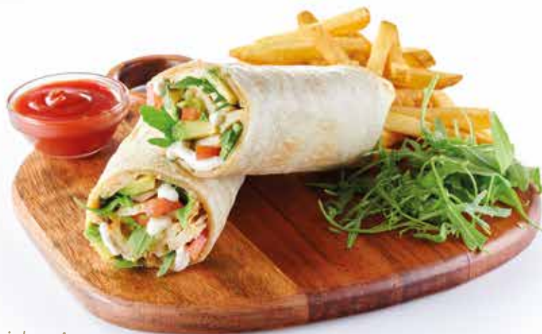
Chicken Avo Caesar Wrap

grilled chicken, avocado, rocket, tomato, Caesar dressing, mozzarella, served with fries or sweet potato fries