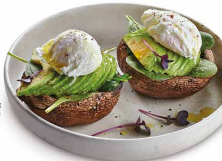
Spinach & Avo On Mushroom

avocado, rocket, thalaga cheese, pomegranate pearls, Arabic spices on multigrain/ sourdough toast