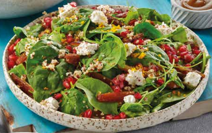
Pomegranate & Date Salad