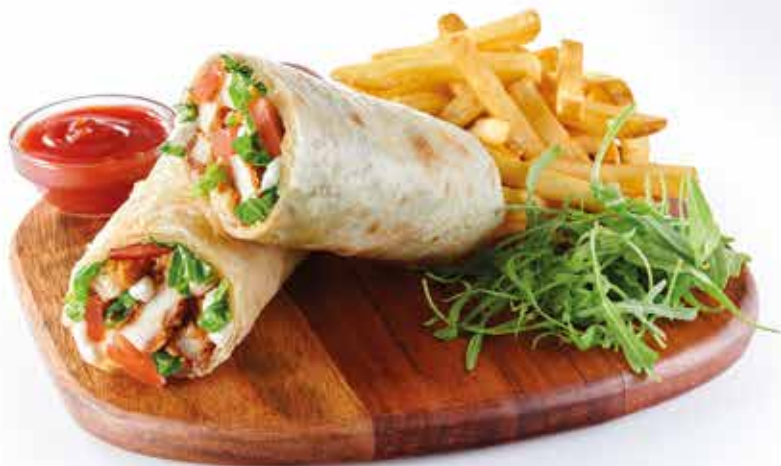
Crispy Chicken Wrap