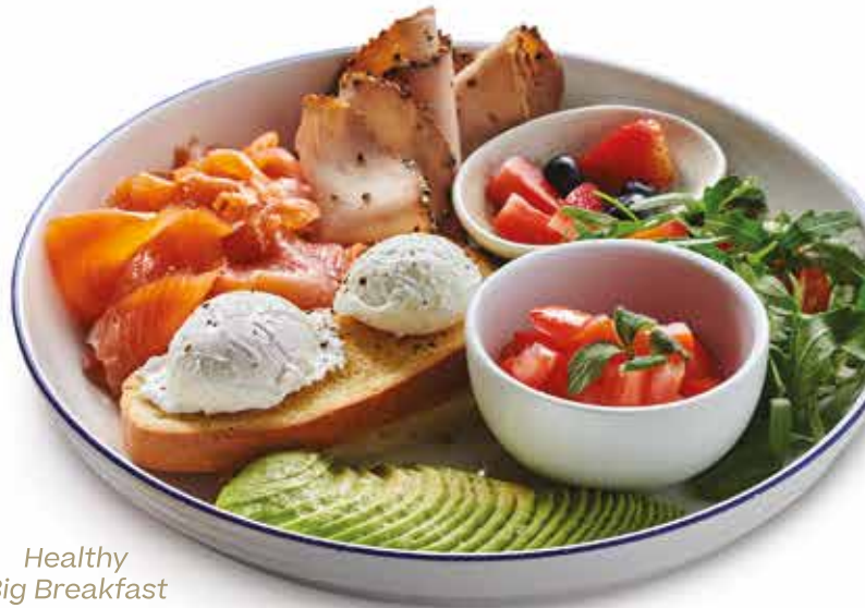
Healthy Big Breakfast

two eggs your way, grilled halloumi, feta makdous*, labneh, tomato, cucumber, Arabic bread *option to replace feta makdous with foul medames