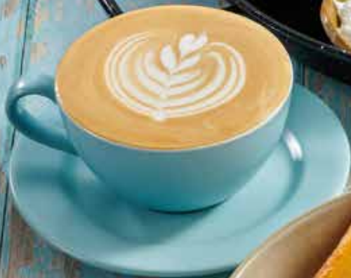
Arabic Big Breakfast