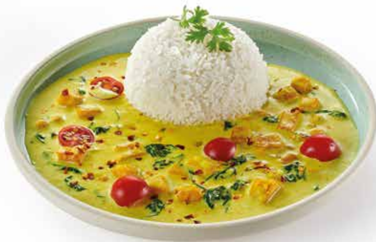
Pumpkin and Chickpea Curry