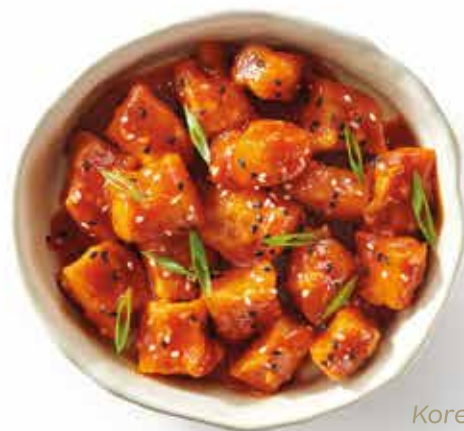
Korean Chicken Bites

gluten-free flatbread, garlic, olive oil, parsley