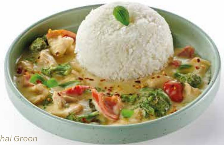
Thai Green Curry

grilled salmon, teriyaki sauce, garlic, avocado, edamame, baby broccolini, cherry tomato, sesame seeds, served with steamed rice