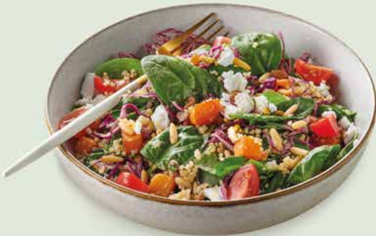
Pumpkin & Vegan Feta Salad