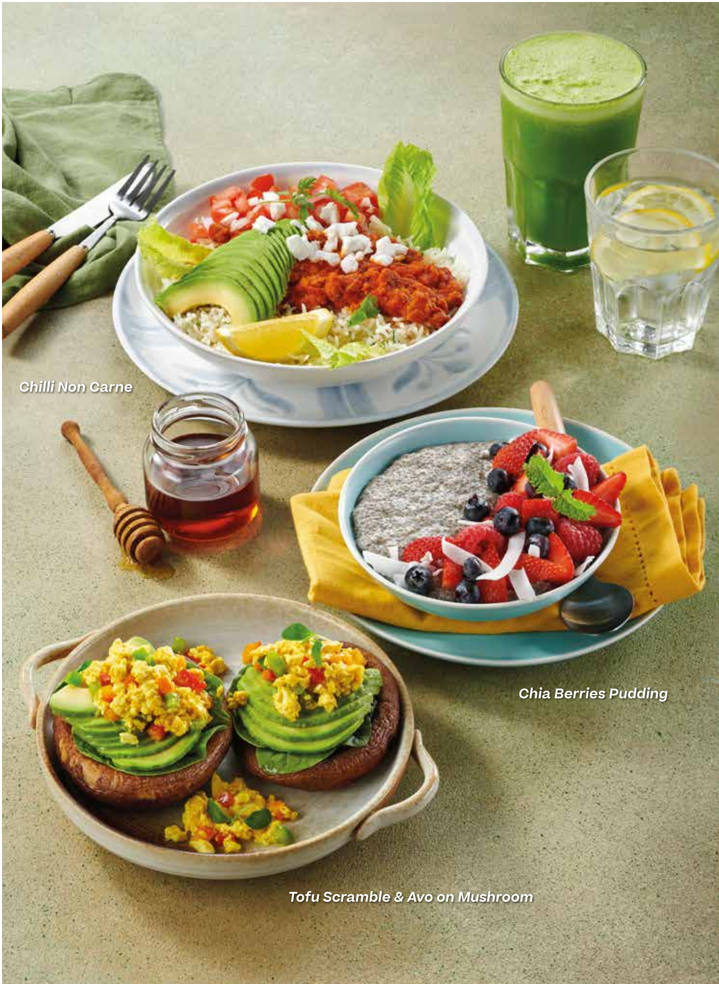
Chilli Non Carne